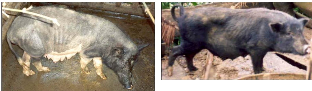
Pictures taken at smallholder households of ethnic Black Thai in Son La province, North West Vietnam (Lemke, 2002)

Meo sows are said to have less favourable mothering abilities. They reach maturity late (8 to 9 months). Under the husbandry conditions of H'mong farmers, litters are with 6 to 7 piglets small; the farrowing interval is high. About 60 to 70% of piglets survive until weaning. H'mong boars are sexually mature at four to five months age (To and Duc, 1967).