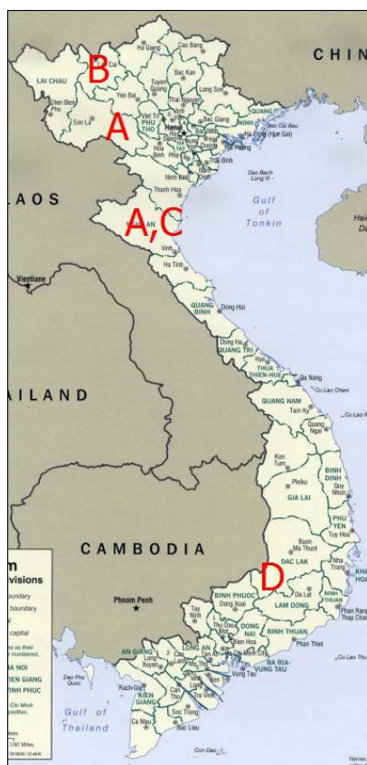
Figure 2: Distribution of major local breeds in Central Vietnam

Upper case letters mark distribution area of pig breeds: A = Meo/Ban pig, B = Muong Khuong pig, C = Co pig, D = Soc pig