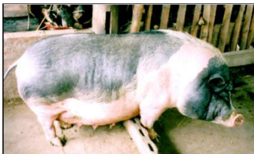
Figure 3: Mong Cai sow

Picture taken at smallholder households of ethnic Black Thai in Son La province, North West Vietnam